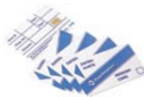
Memory cards for storing measurement and calibration settings