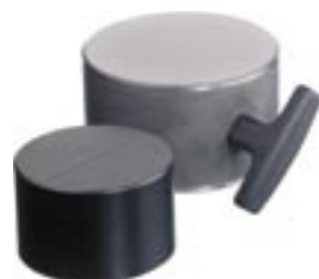
Certified hardness reference blocks