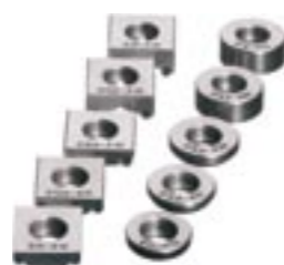
Test attachments for curved surfaces