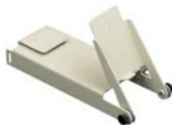
Instrument carrier and prop-up stand