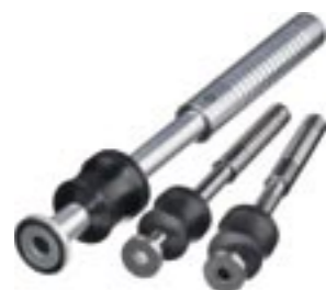
Impact devices for different applications