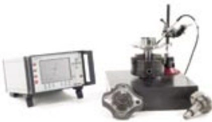
Inspection of Rotating Parts

Determining that a component is within the specified hardness range is critical to many automotive components. By detecting the difference in conductivity it is straight forward to segregate components within hardness specification from those that are not.