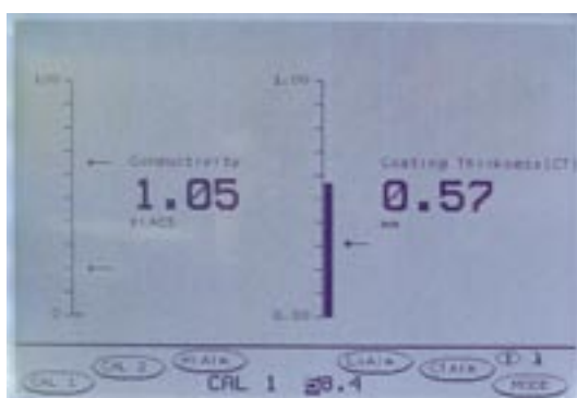
Conductivity & Coating Thickness Measurement Screen

Of course, greater line speeds will increase the demand for high performance filters to maintain a good signal to noise ratio - Vector 2d already has these filters incorporated into its design.