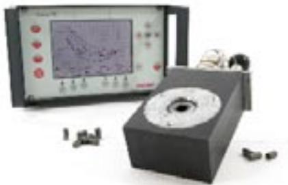
Material Sorting & Verification