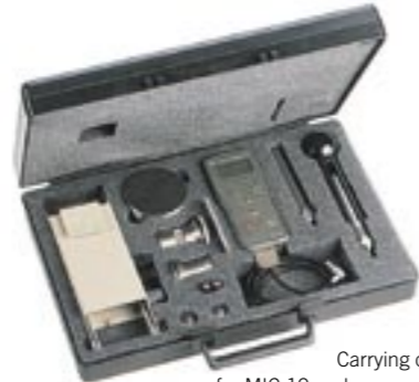
Carrying case for MIC 10 and accessories