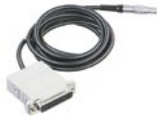
Serial data cable for printer and PC