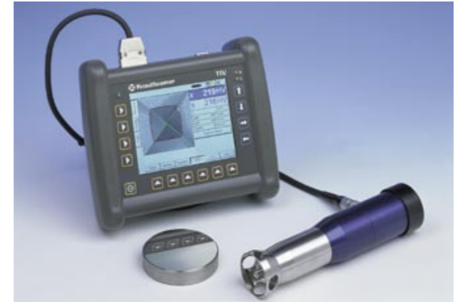
The TIV hardness tester with probe and hardness reference block. The probe contains high-tech features – the optical system and the CCD camera enable viewing through the diamond. Direction independence is also a proof of the patented Krautkramer technology: you can measure in any direction – without any additional settings.

The color LCD of the TIV hardness tester does not only show you the image of the diamond's indentation but also the directly displayed reading in the selected hardness scale. The graphic user interface shown on the display is adapted to the known Windows standard. In this way, you will swiftly have a good grasp of how the instrument should be operated, irrespective of if you want to configure, measure, evaluate, or store. The special extra: You do not need a mouse to select functions because the instrument has a touch screen capability using a pen. However, as an alternative, conventional pushbuttons are also available for most of the functions.