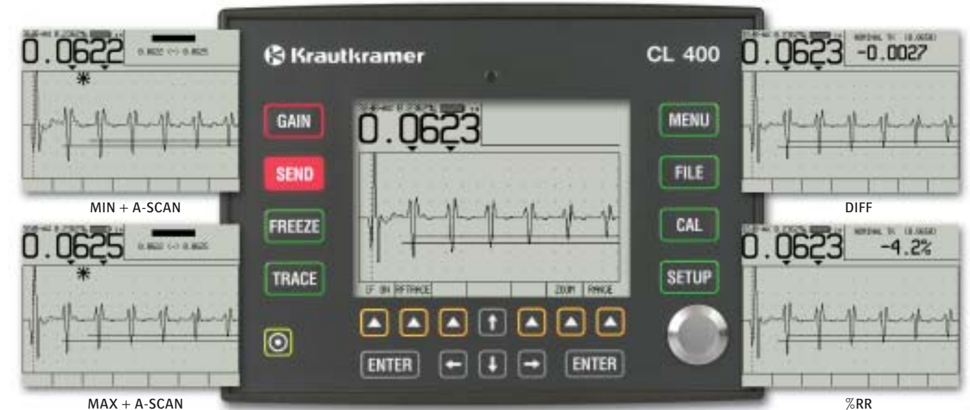
A-Scan option provides a variety of views beyond the above THICKNESS + A-SCAN.

The basic CL 400 model is the cornerstone for constructing a solution that meets your exact needs by adding the options of displaying an A-Scan or Data Recorder. One or both can be installed at the time of purchase or can be retrofitted later as your testing requirements change.