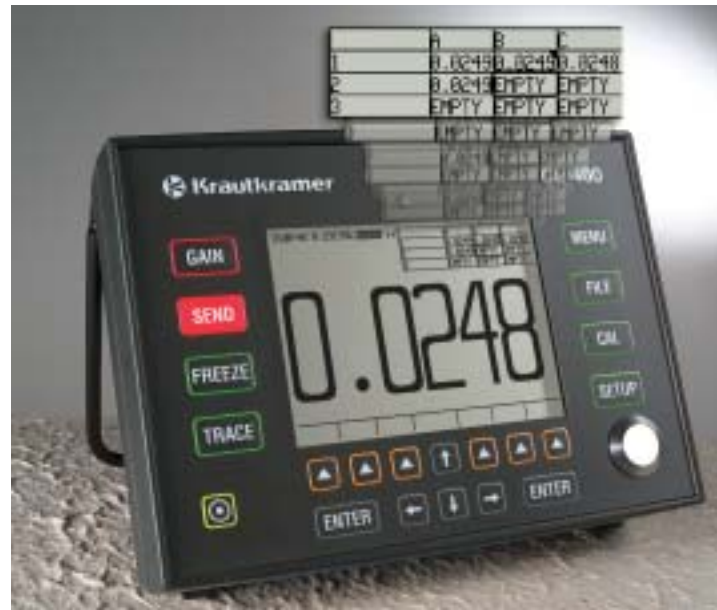
Data Recorder Window

UltraMATE® is a 2-way communication tool. You can use the software to transfer and store a Custom Setup that was created from one CL 400 instrument to another. UltraMATE® also provides a quick alternative for creating a Data Recorder file. Instead of using the CL 400's keypad, create a data file using UltraMATE® and then download it