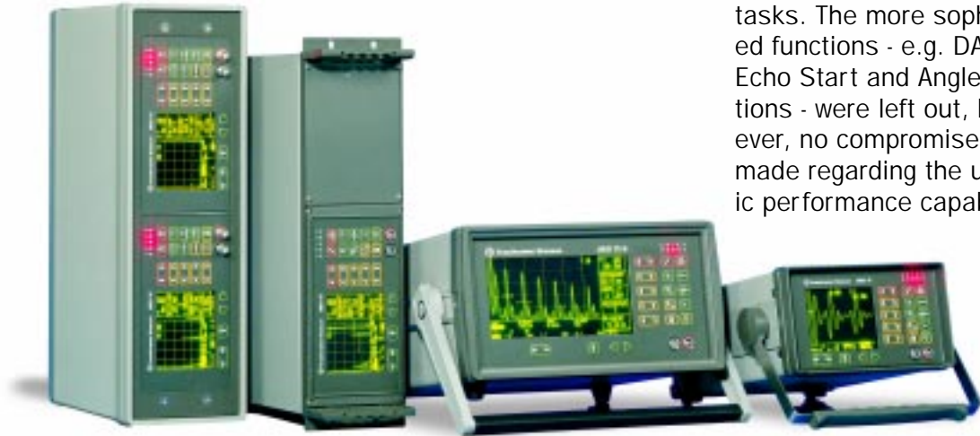
The USD 15 product family with Double Rack and Rack, USD 15 SX (USD 15 SQ) and USD 15 X (USD 15B)