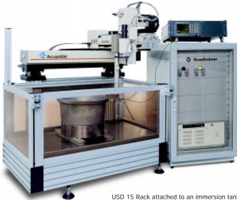
USD 15 Rack attached to an immersion tank