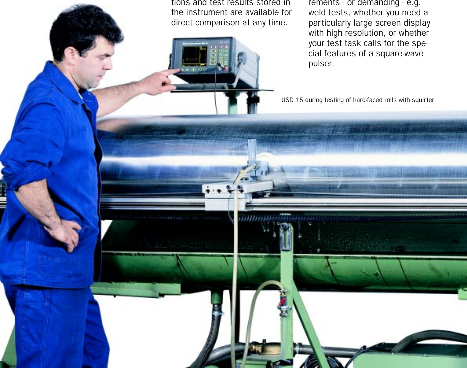
USD 15 during testing of hard-faced rolls with squirter

Whatever the test problem, our USD 15 instrument family will offer you the solution. From our range of instruments, select the one suitable for your specific needs - depending on whether you require to test in a portable or a stationary mode, whether single-channel or multichannel testing is to be made, or whether your applications are simple - e.g. precise thickness measurements - or demanding - e.g. weld tests, whether you need a particularly large screen display with high resolution, or whether your test task calls for the special features of a square-wave pulser.