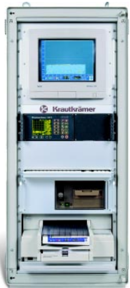
USD 15 Rack in the 19" cabinet

It makes no difference whether your readings are analog or digital, they are all updated with the pulse repetition frequency. Another control signal calls a preset dataset, which enables for example to take changes in the test object's geometry into account without interrupting the test sequence.